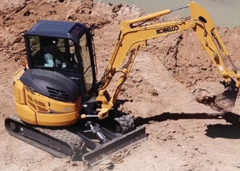
SK17SR-6E 3,681 LBS